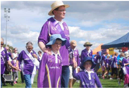
Great to see lots of young people involved. NSW MP for Orange Andrew Gee walked with his family.

Orange Aero Club had nine registrations (and there were several other members with other teams), and raised a modest total of $738. Thanks to all those who supported the