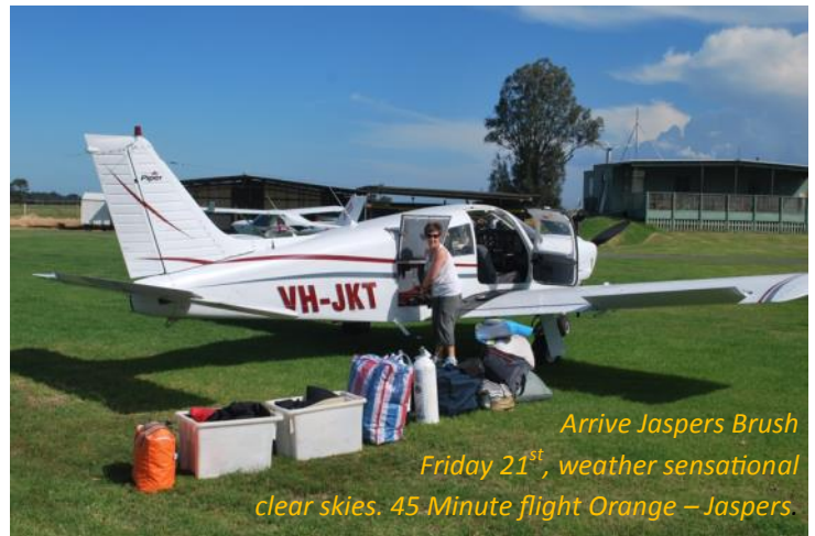
Arrive Jaspers Brush Friday 21 st , weather sensational clear skies. 45 Minute flight Orange – Jaspers.

https://dl.dropboxusercontent.com/u/61171843/Jaspers%20Brush%20Fly-In.docx