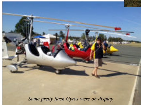
Some pretty flash Gyros were on display

The main days of the Fly-in were Friday and Saturday over Easter, and there was a full program of workshops and seminars, presentations by manufacturers and distributors and off site attractions. The program was advertised and listed in advance on the special Natfly website, so attendees could plan their whole weekend in advance from home.