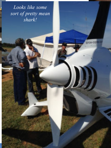
Looks like some sort of pretty mean shark!

many of the pilots who flew in on Thursday by randomly conducting 'Ramp Checks' to make sure pilots and their aircraft met all the requirements for conducting cross country flights. It was purely educational, they said, but one wonders if there aren't better ways to educate! (I was one who got checked and had everything in place, so I don't know what may have happened to those who didn't meet regulations.)