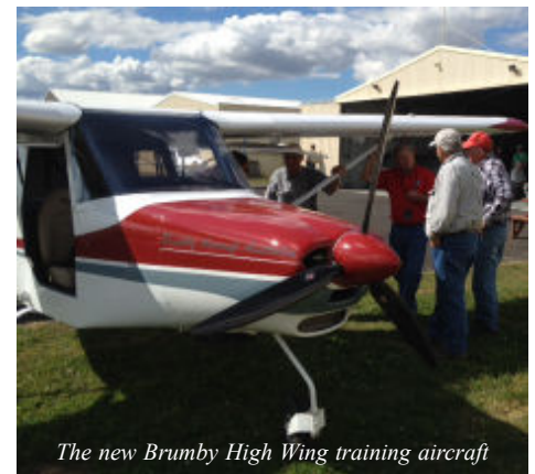
The new Brumby High Wing training aircraft